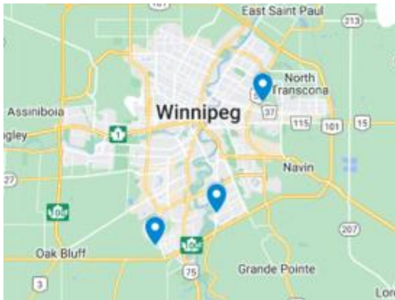
Location of Investment Properties owned by the Trust at September 30, 2022

The Trust's current portfolio consists of newer generation investment properties that were constructed in 2006 (103 units), 2017-2019 (148 units) and 2018-2021 (112 units). Newer generation portfolios typically require lower maintenance expenses and capital expenditures compared to older generation portfolios and, in Manitoba, new generation rentals are exempt from rent control. The Manitoba Government has enacted a rental freeze in 2022 and 2023, whereby landlords are not permitted to increase rental rates outside of the rental guidelines, subject to certain exemptions. 291 of the 363 rental units that the Trust has acquired in 2021 are exempt from the rental freeze due to the age of the buildings, and unrestricted financing agreements, and as such, the Trust will continue to adjust rental rates as the market allows.